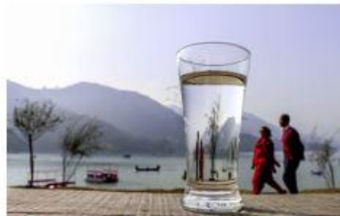
Phewa Lake, Pokhara