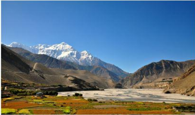
The Forbidden Kingdom – Mustang district