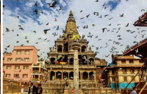
Patan Durbar Square