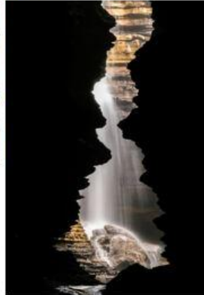
Gupteshwari Cave, Pokhara