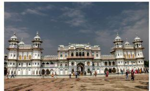
Janaki Temple, Janakpur