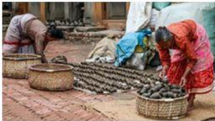
Pottery in Bhaktapur Durbar Square