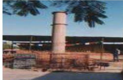
Lumbini: Birthplace of Buddha