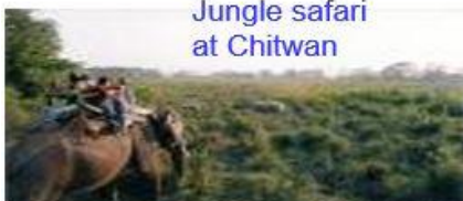
Jungle safari at Chitwan