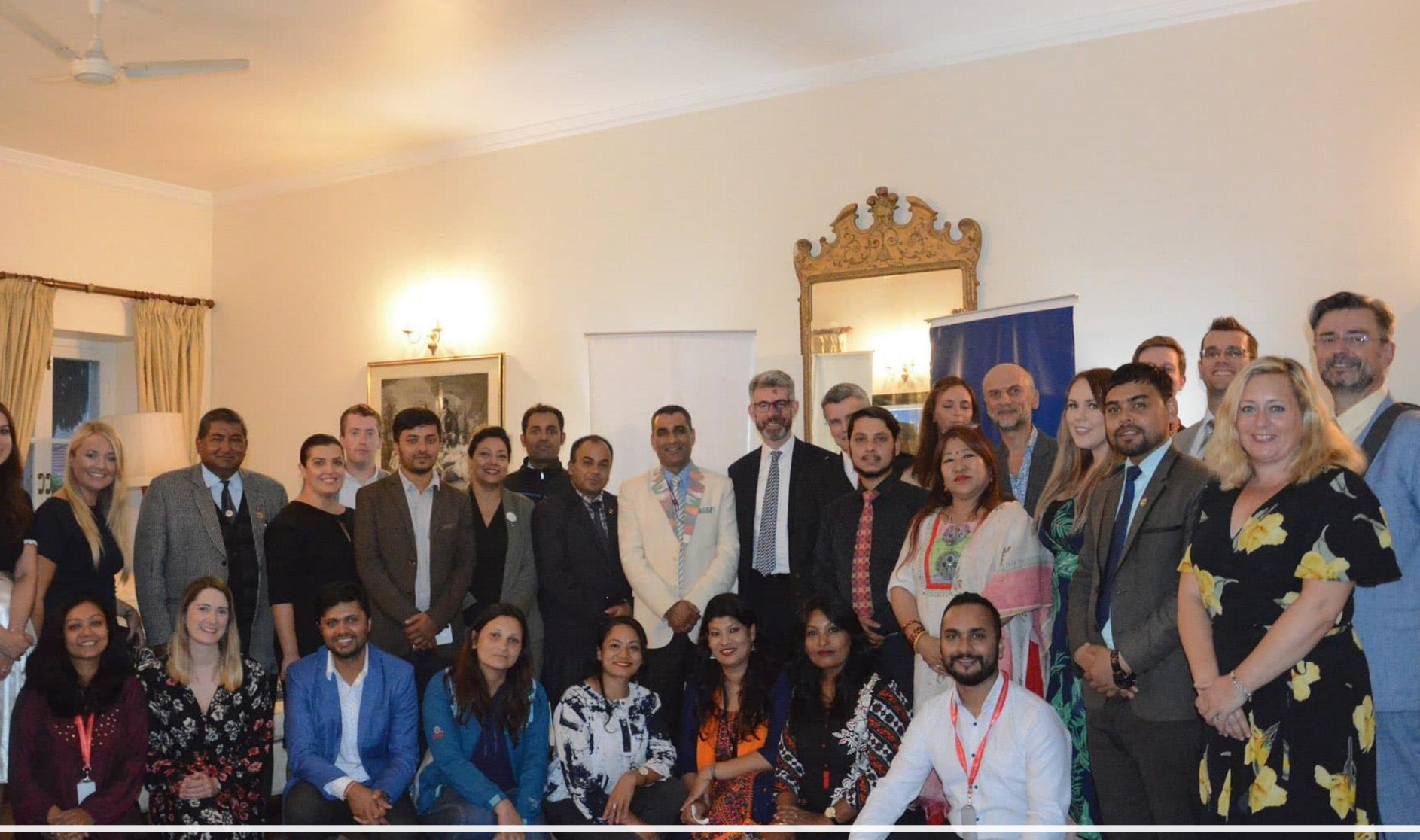
At the British Ambassador to Nepal's Residence.